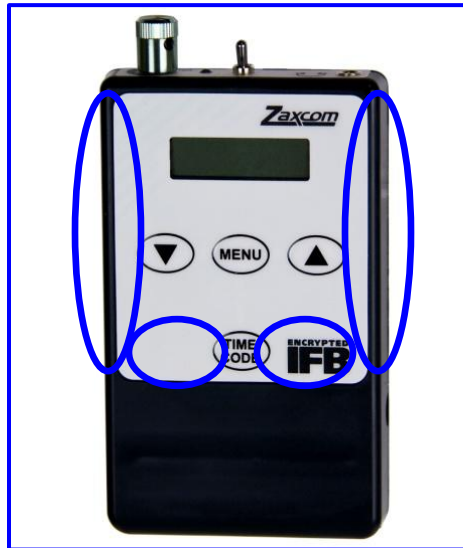
Figure 2-2 Location of IFB Antennas

IMPORTANT: The antennas are located behind the white faceplate sticker and along both sides as indicated below. If placed in a pocket, it should be facing out. Don't place anything in front of these areas that could block reception.