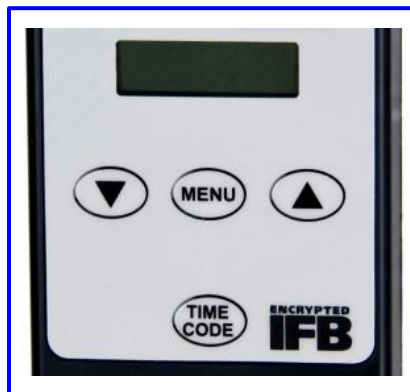
Figure 1-1 ERXI Keys

Each menu has several pages allowing you to change configuration settings. All of these settings are stored in Flash ROM immediately after making the change.